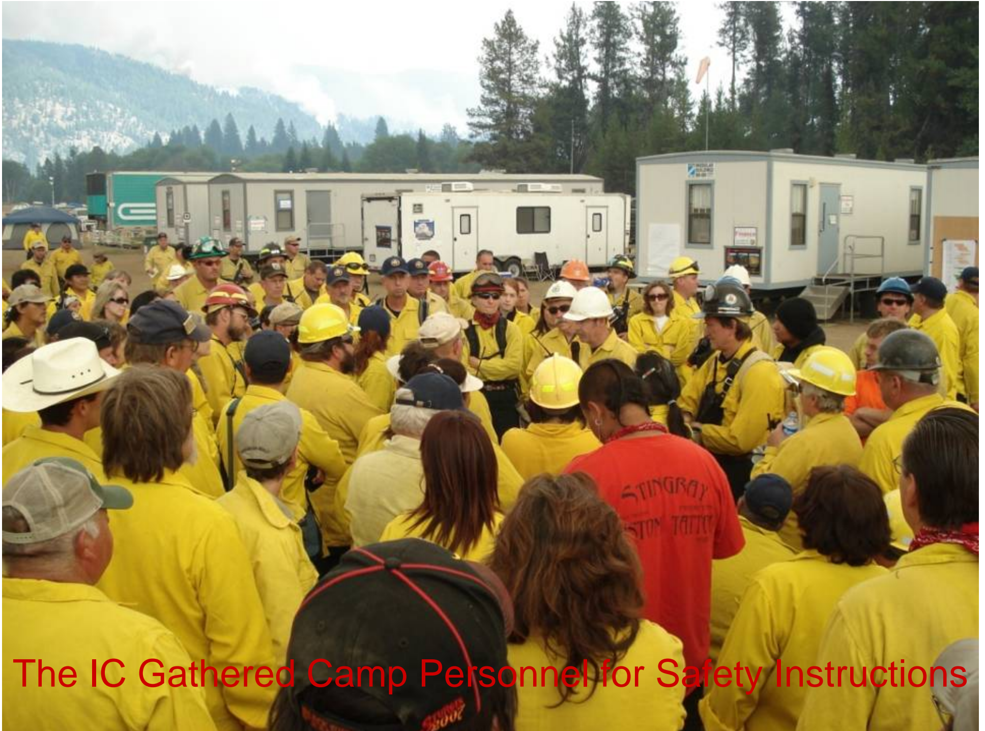
The IC Gathered Camp Personnel for Safety Instructions