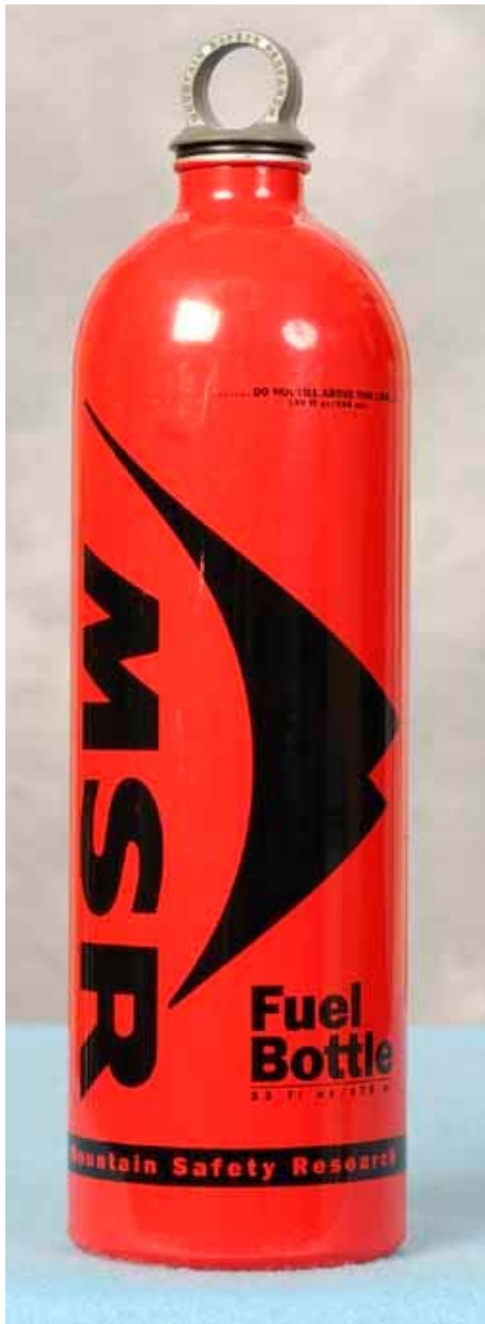
An older MSR bottle that also complies with GSA requirements